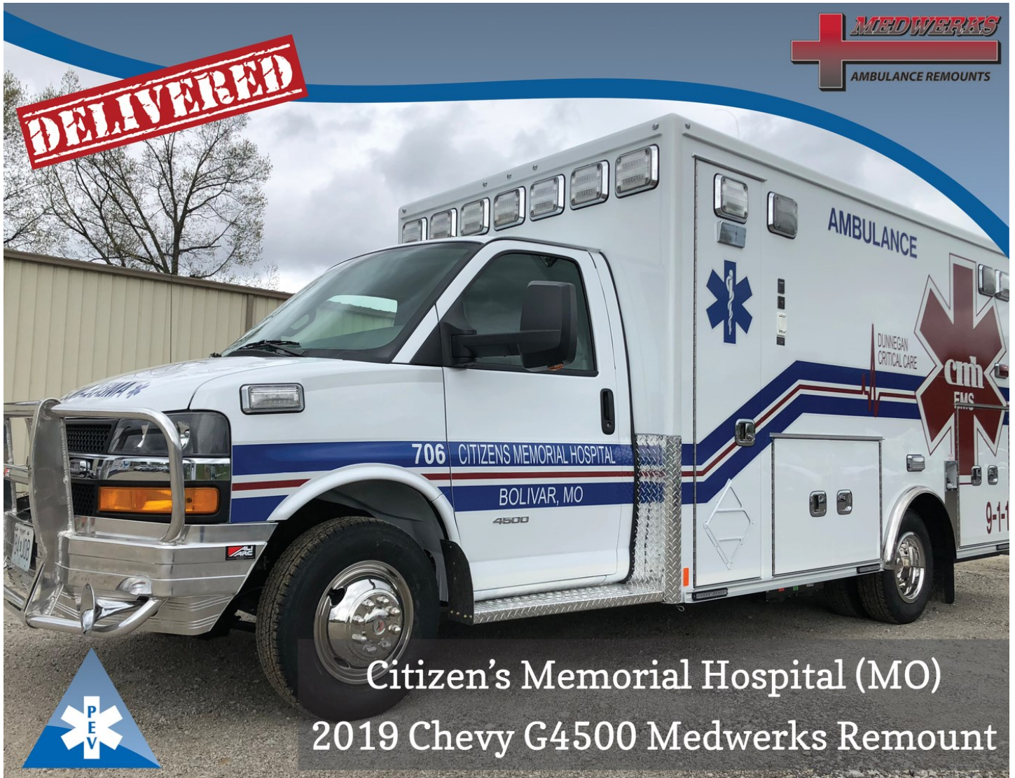
Citizen's Memorial Hospital (MO) 2019 Chevy G4500 Medwerks Remount