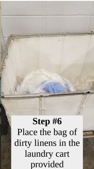
Step #6 Place the bag of dirty linens in the laundry cart provided