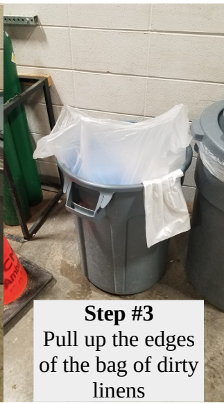
Step #3 Pull up the edges of the bag of dirty linens