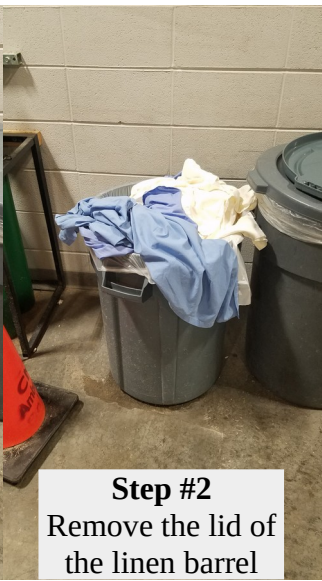
Step #2 Remove the lid of the linen barrel