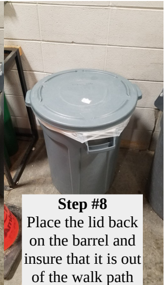
Step #8 Place the lid back on the barrel and insure that it is out of the walk path