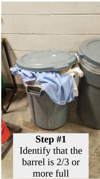
Step #1 Identify that the barrel is 2/3 or more full