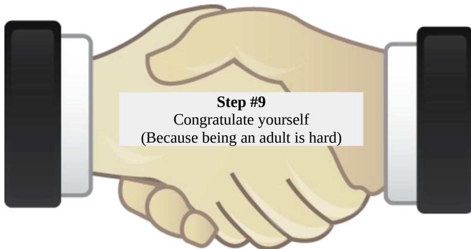
Step #9 Congratulate yourself (Because being an adult is hard)