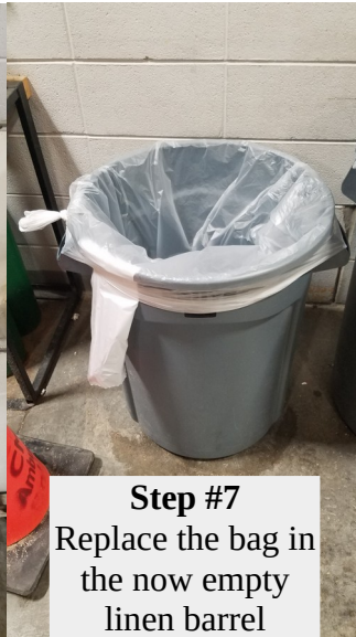
Step #7 Replace the bag in the now empty linen barrel